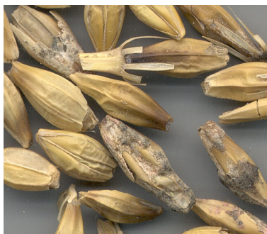
Fusarium graminearum infected barley with 15 ppm deoxynivalenol (DON). Compare with symptoms caused by other diseases