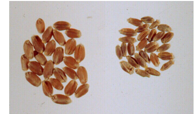
Healthy Shriveled kernels