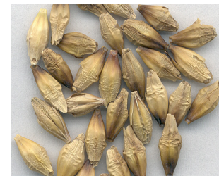
Brownish discoloration (kernel smudge) in barley caused by spot blotch fungus infection