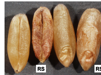
Reddish discoloration (red smudge - RS) in durum caused by tan spot fungus infection of kernels

Damage due to diseases and midge that can be confused with fusarium damaged kernels caused by Fusarium graminearum