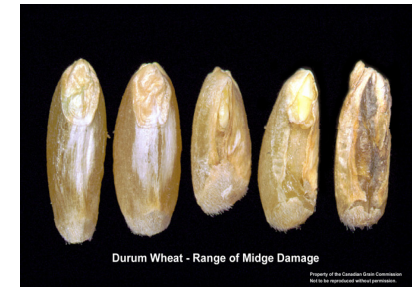
Orange wheat blossom midge damage in wheat