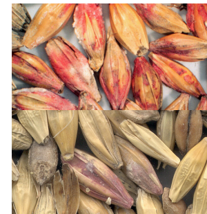
Reddish kernel discoloration in barley due to Fusarium avenaceum (does not produce DON)