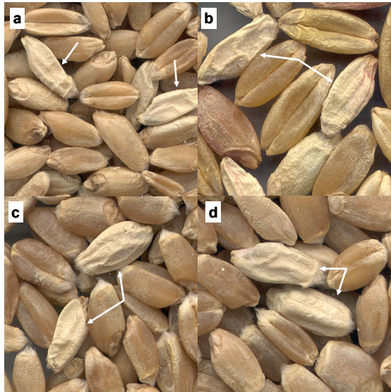
FDK in Canada Prairie Spring (a), Amber Durum (b), and Canadian Western Red Spring (c & d). Currently, FDK's in Alberta are relatively rare and typically caused by species other than F. graminearum . In Manitoba most FDK's are caused by F. graminearum