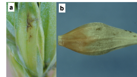
Brownish lesion (a) and orangish discoloration (b) of barley kernels due to the net blotch fungus